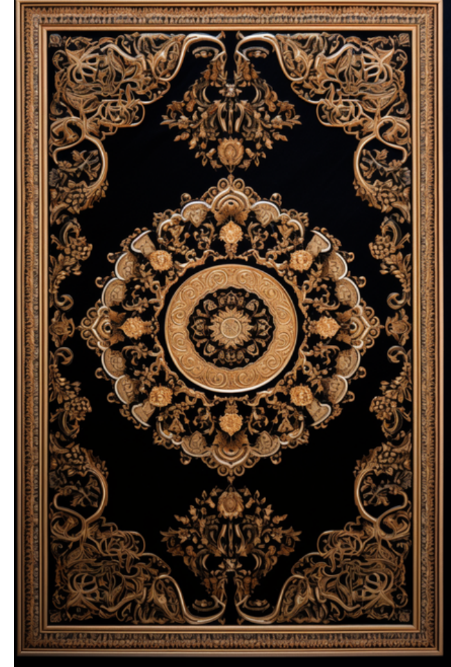
KeniHome Digital Printed Area Rugs