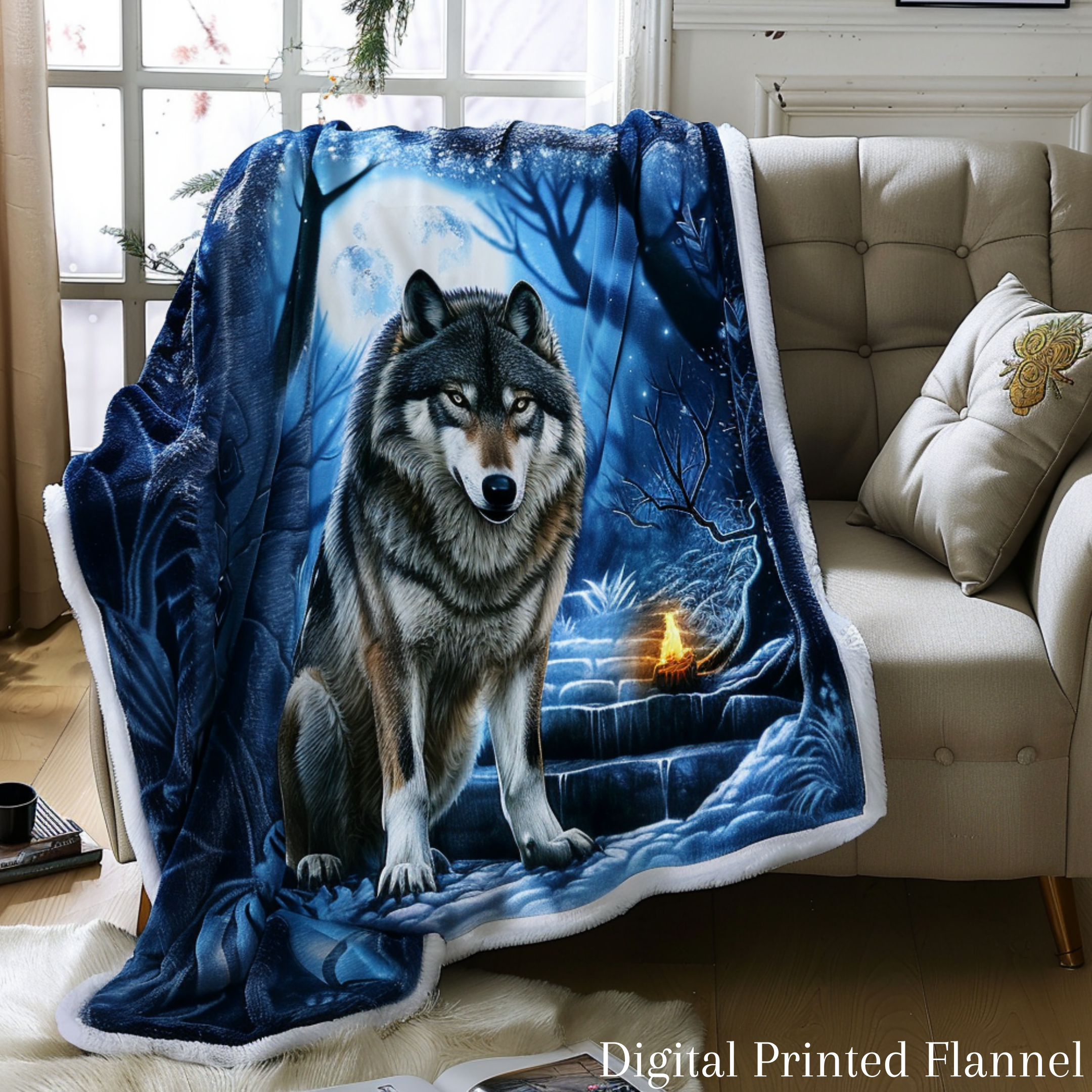
Digital Printed Flannel